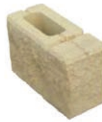
Tasman Full Corner 145mm x 340m x 200mm Available in left or right corner Code 225-34