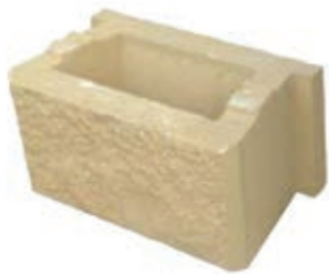
Tasman Wall Block 390mm x 225m x 200mm 13 per sqm 75 per pallet Code 225-01