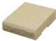
Tasman 200mm Cap 200mm x 225m x 60mm 5 per lineal m 300 per pallet Code 60-230