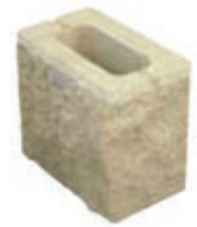
Tasman Half Corner 145mm x 235m x 200mm Available in left or right corner Code 225-14

Note: For Tasman Walls over 660mm high please seek specific engineering advice