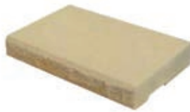
Tasman Cap 390mm x 240m x 60mm 2.5 per lineal m 120 per pallet Code 60-240