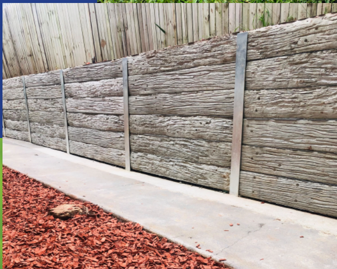
Woodgrain Snow Gum (L), Rock Face Basalt (R).

Australian Owned, Designed and Manufactured