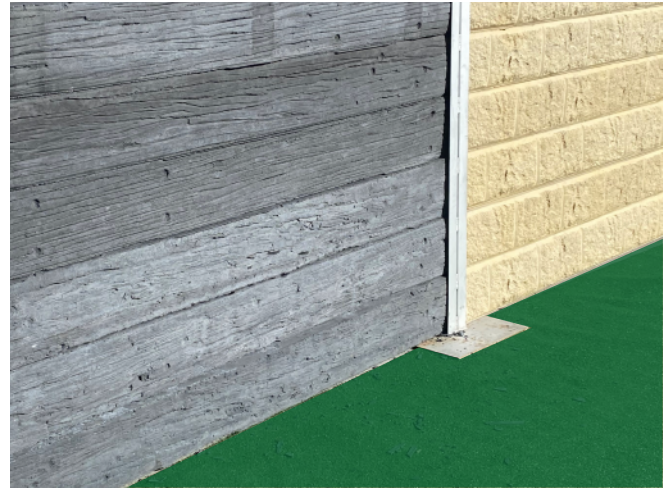
Woodgrain Black Wattle (L), Rock Face Sand (R).

*A variation in width is possible across the range of textures.